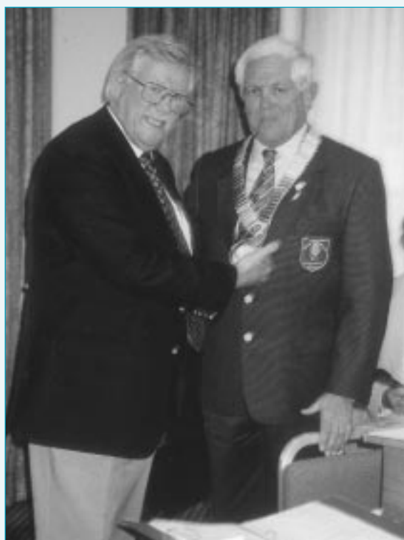
THE CHAIN OF OFFICE PASSES ON.

As you receive this District magazine our new Rotary year will have started. I believe that it will be a great year of challenge and opportunity. It will be the year that Rotary raises the required funds to eradicate polio from the face of the world. What a legacy for the world as Rotary starts to celebrate its Centenary in the year 2005.