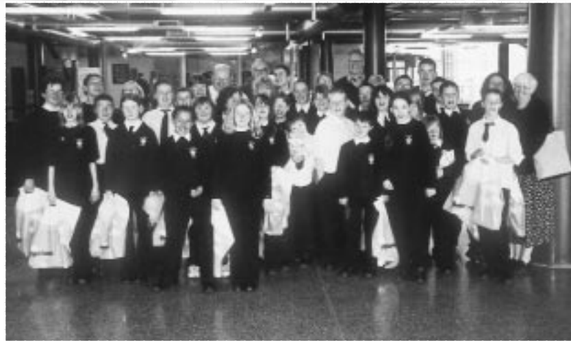
Swadlincote's guests from the learning support base at Pingle School, Swadlincote, in Birmingham's 'Thank Tank'.